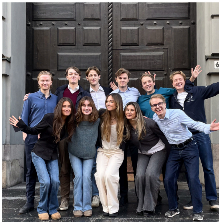
Sasse Board 25 / 26